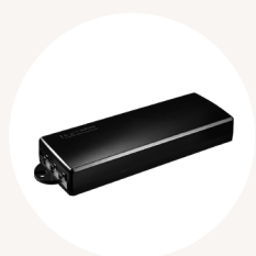
TC16 support 3 motors