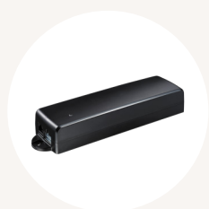
TC11 support a single motor

Have less than 0.1W stand-by power consumption option that enhances power efficiency.