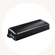
TC15 support 2 motors